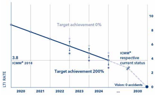
Schematic illustration. * International Council on Mining and Metals.

Example calculation for the LTI I program: